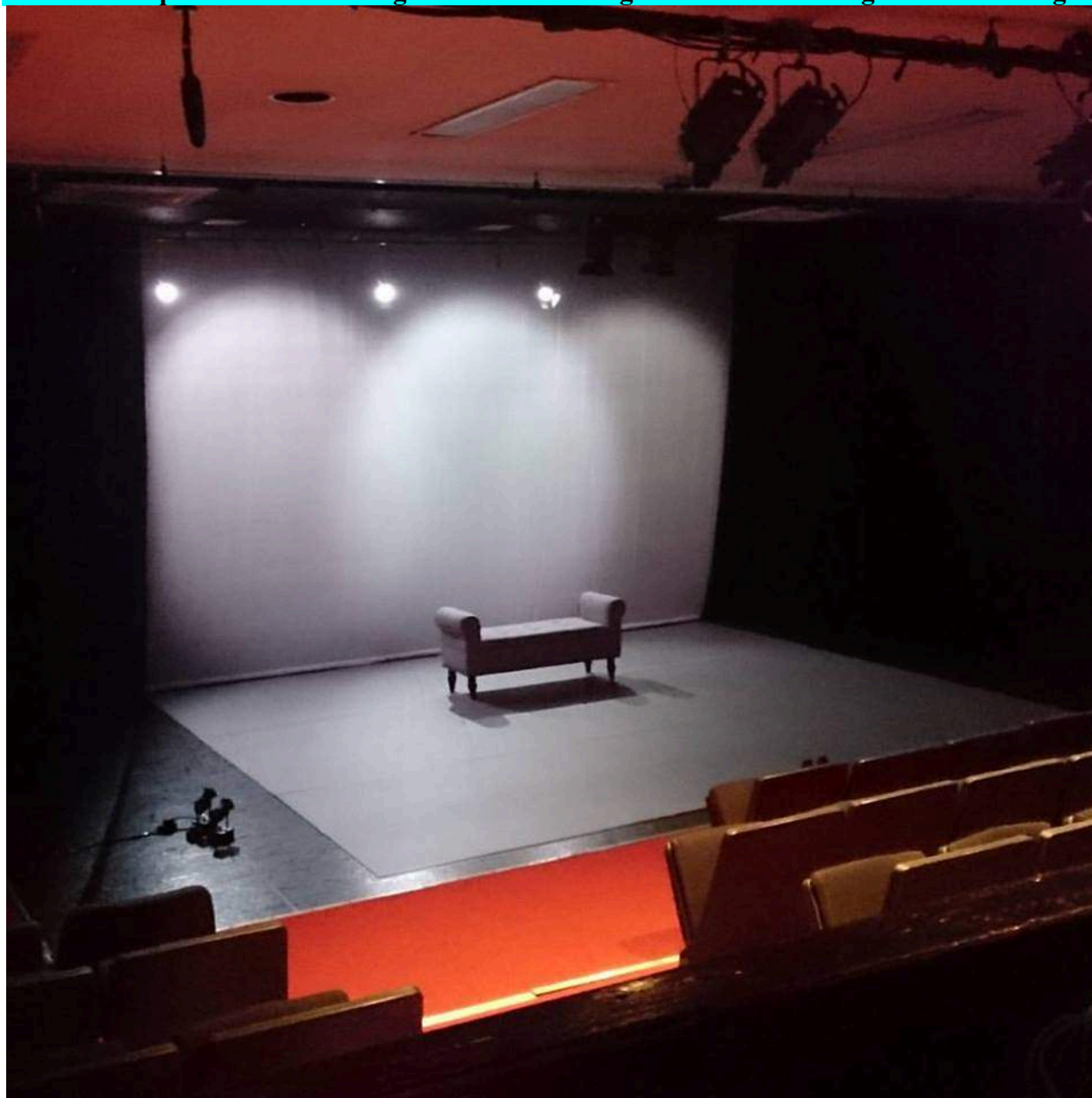
Photo shows preset with house lights on. NB this rig does not show the gauze at full height.

6 floor channels required as birdies each need a separate channel (15A plug) & TRS (birdie cables only 1ft long)